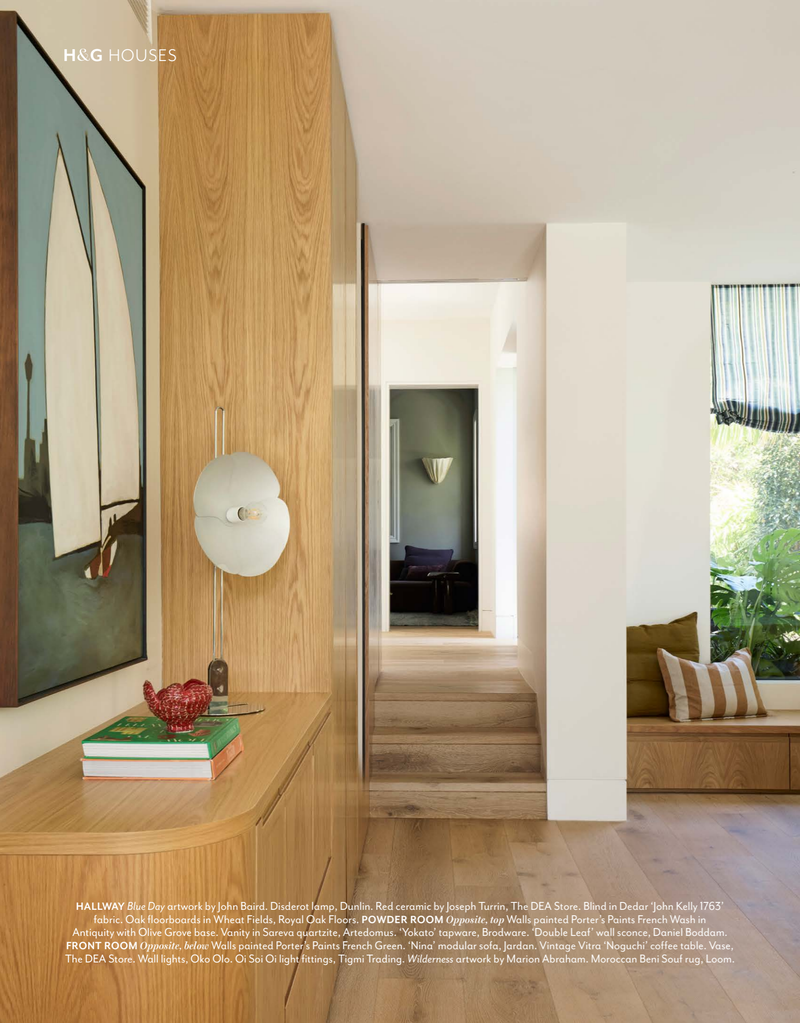
HALLWAY Blue Day artwork by John Baird. Disderot lamp, Dunlin. Red ceramic by Joseph Turrin, The DEA Store. Blind in Dedar 'John Kelly 1763' fabric. Oak floorboards in Wheat Fields, Royal Oak Floors. POWDER ROOM Opposite, top Walls painted Porter's Paints French Wash in Antiquity with Olive Grove base. Vanity in Sareva quartzite, Artedomus. 'Yokato' tapware, Brodware. 'Double Leaf' wall sconce, Daniel Boddam. FRONT ROOM Opposite, below Walls painted Porter's Paints French Green. 'Nina' modular sofa, Jordan. Vintage Vitra 'Noguchi' coffee table. Vase, The DEA Store. Wall lights, Oko Olo. Oi Soi Oi light fittings, Tigmi Trading. Wilderness artwork by Marion Abraham. Moroccan Beni Souf rug, Loom.