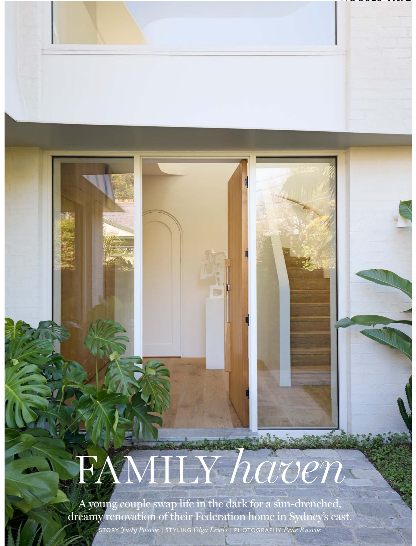
EXTERIOR The decorative verandah and facade of this Federation house in Sydney's Eastern Suburbs has been restored and painted Dulux Surfmist. ENTRANCE Old meets new at the entrance, where a pivot door by Estalis lends a contemporary look to the heritage facade. Path in Hampton Quartz random cobblestones, GatherCo. Oak floorboards in Wheat Fields, Royal Oak Floors.